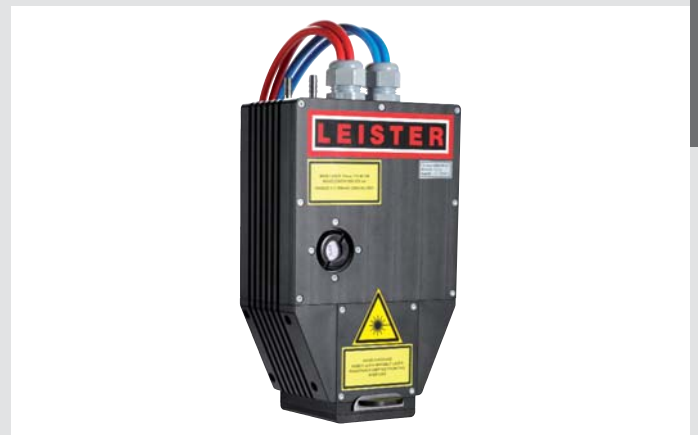
Line Laser LineBeam AT.