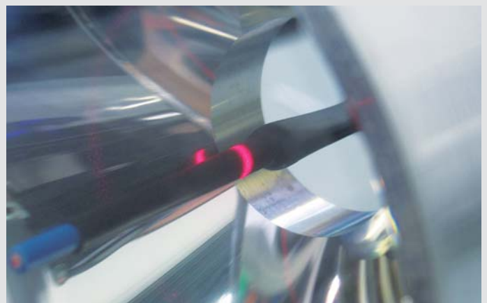
Precise shrinking for sensitive parts.