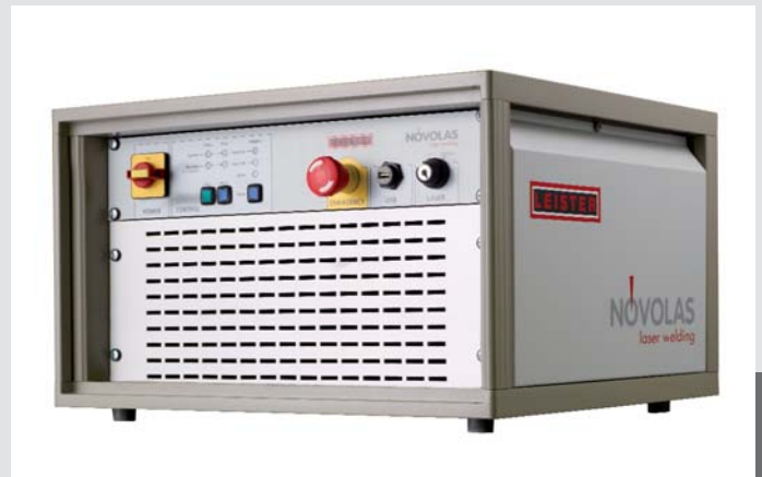
BASIC AT Compact: Compact and cost-efficient laser system featuring an air-cooled diode laser.